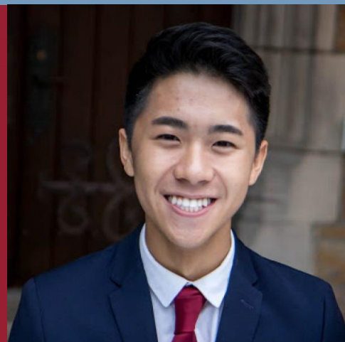
Gilman Alumni Ambassador