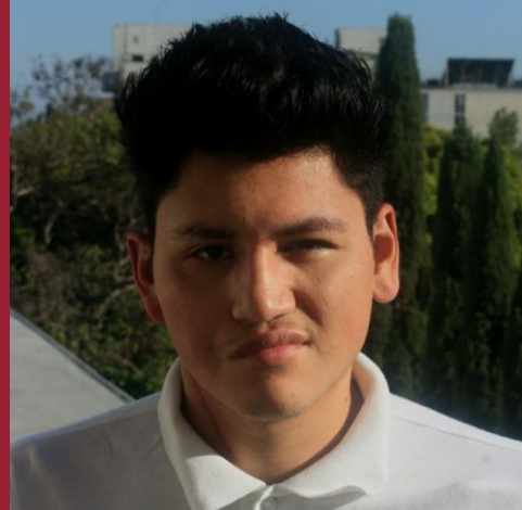
Gilman Alumni Ambassador