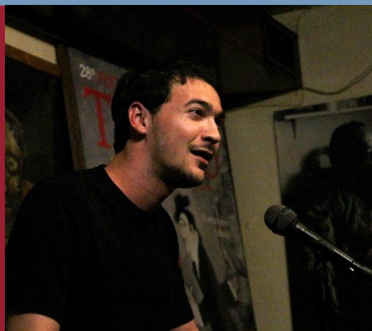
Gilman Alumni Ambassador