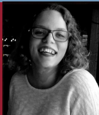
Gilman Alumni Ambassador