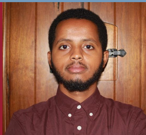
Gilman Alumni Ambassador