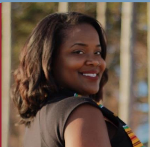
Gilman Alumni Ambassador