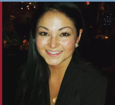
Gilman Alumni Ambassador