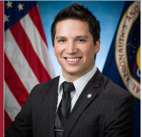
Gilman Alumni Ambassador Gilman-Reach the World Traveler