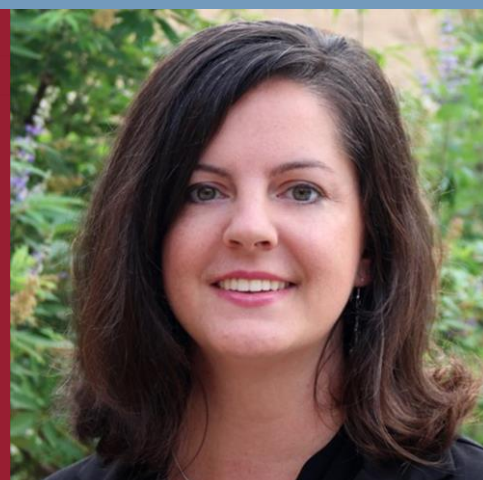
Gilman Alumni Ambassador