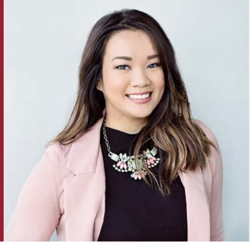
Gilman Alumni Ambassador