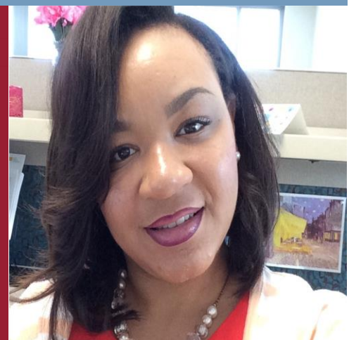
Gilman Alumni Ambassador