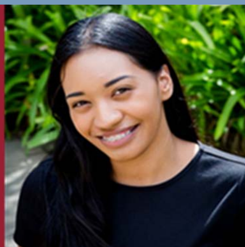
Gilman Alumni Ambassador