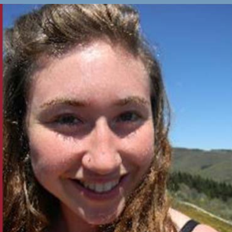
Gilman Alumni Ambassador