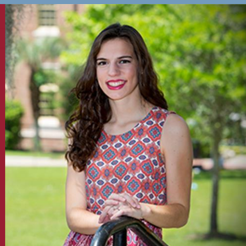
Gilman Alumni Ambassador