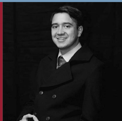
Gilman Alumni Ambassador