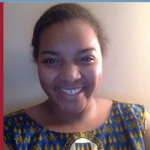
Gilman Alumni Ambassador