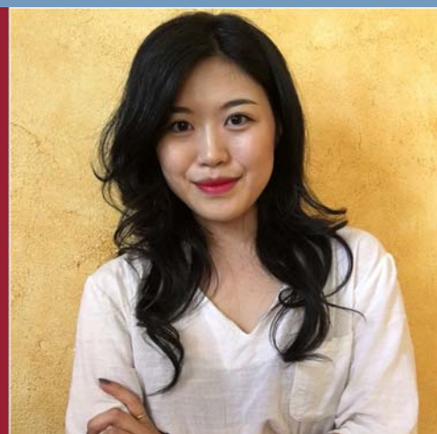
Gilman Alumni Ambassador