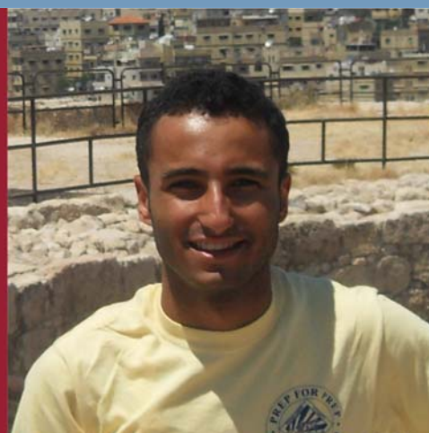
Gilman Alumni Ambassador