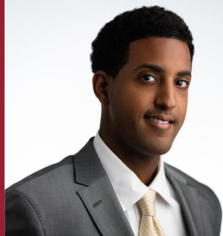
Gilman Alumni Ambassador