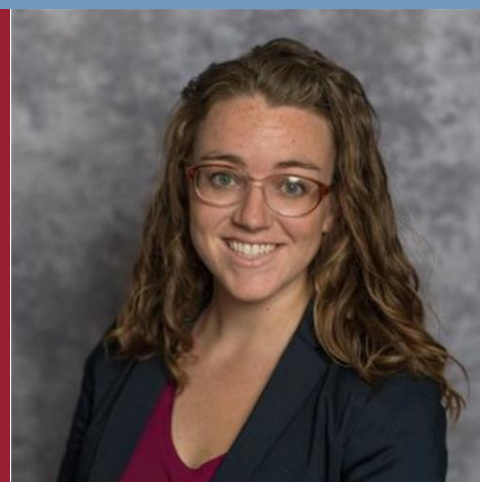
Gilman Alumni Ambassador