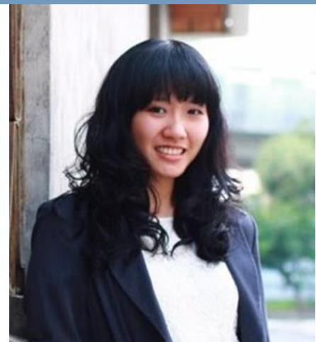
Gilman Alumni Ambassador